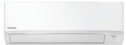
STANDARD INVERTER R32